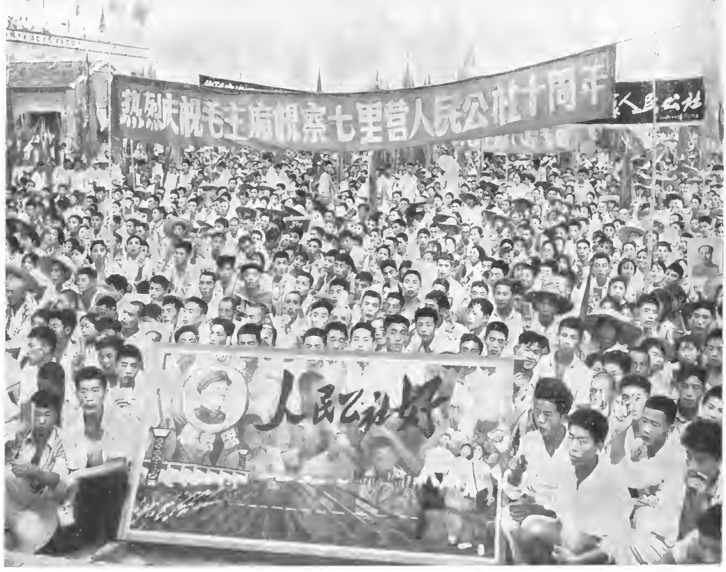
Part of a mass meeting held on Angust 6 by 100,000 people of the Hsinhsiang area and the Chiliying People's Commune to celebrate the tenth anniversary of Chairman Mao's inspection tour of the commune.